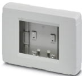
Display housing, 5.7", light gray, central window, front level, for battery pack consisting of two half shells, with screws and battery pack contacts

Please be informed that the data shown in this PDF Document is generated from our Online Catalog. Please find the complete data in the user's documentation. Our General Terms of Use for Downloads are valid ( http://phoenixcontact.com/download )