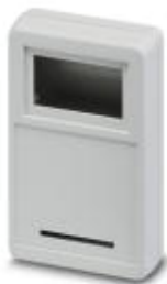
Handheld housing, C-Mini, light gray, consisting of two half shells with screws, front 1.1 mm recessed with window and keypad slot

Please be informed that the data shown in this PDF Document is generated from our Online Catalog. Please find the complete data in the user's documentation. Our General Terms of Use for Downloads are valid ( http://phoenixcontact.com/download )