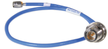
CASE STYLE: KQ1669-XX