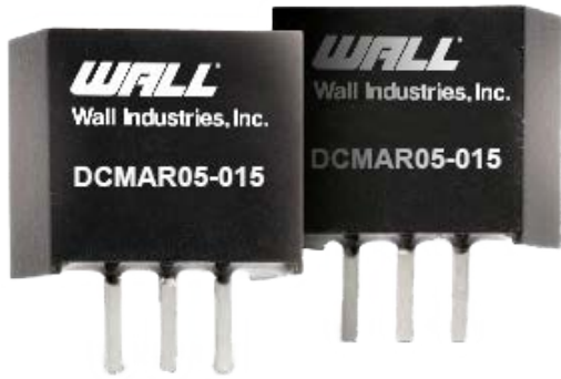
Size: 0.45in x 0.30in x 0.40in (11.5mm x 7.55mm x 10.2mm)