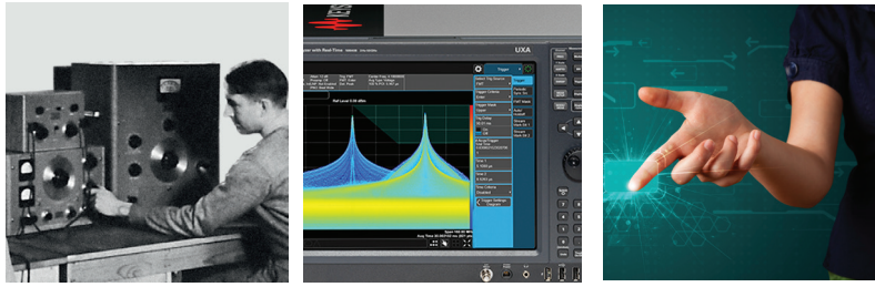
From Hewlett-Packard to Agilent to Keysight

Our unique combination of hardware, software, support, and people can help you reach your next breakthrough. We are unlocking the future of technology.