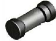
SURFACE MOUNT LL34