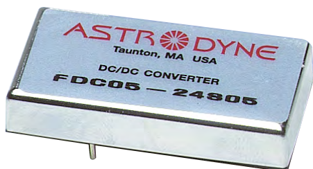
Unit measures 1"W x 2"L x 0.375"H