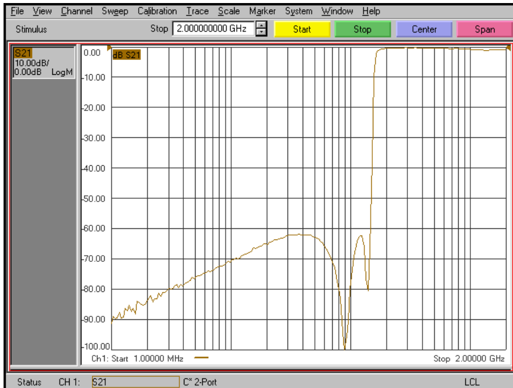
Overall Response (10 dB/div)