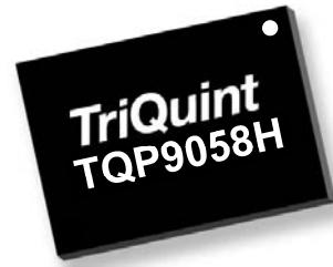
42-pin 5 x 7 mm Package