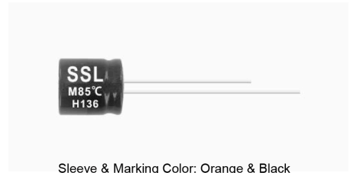
Sleeve & Marking Color: Orange & Black