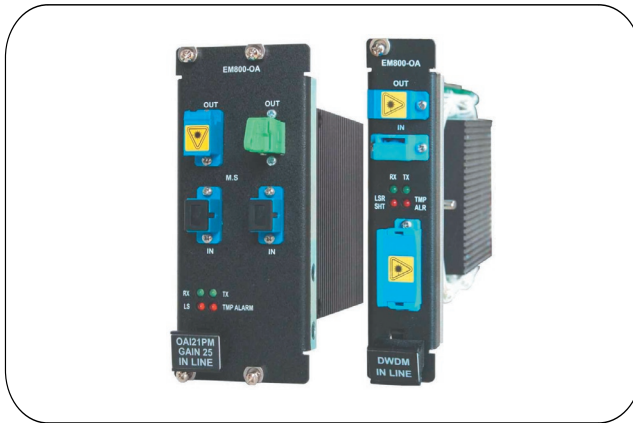
Optical Amplifier modules