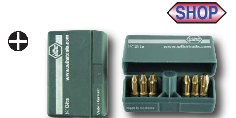
711 96 PokitPak - Phillips TiN Coated Insert Bits In Molded Case -