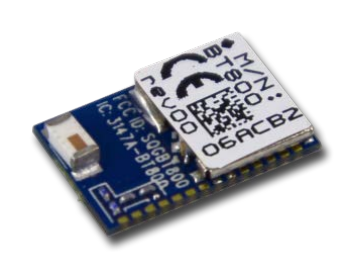
BT800 - BTv4.0 USB HCI Module

A fully featured, low-cost developer's kit is available for prototyping, debug and integration testing of the BT800 series modules and further reduces risk and time in development cycles.