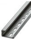
G-profile DIN rail, material: Steel, perforated, height 15 mm, width 32 mm, length 2 m

DIN rail - NS 35/15 CU UNPERF 2000MM - 1201895