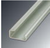
G rail 32 mm (NS 32)

DIN rail - NS 32 AL UNPERF 2000MM - 1201028