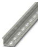
DIN rail, material: steel galvanized and passivated with a thick layer, perforated, height 15 mm, width 35 mm, length: 2000 m

DIN rail perforated - NS 35/15 PERF 2000MM - 1201730