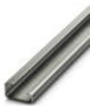
G-profile DIN rail, material: Steel, unperforated, height 15 mm, width 32 mm, length 2 m

DIN rail - NS 32 UNPERF 2000MM - 1201015