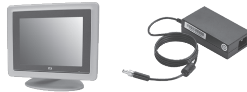
▲ Desktop stand