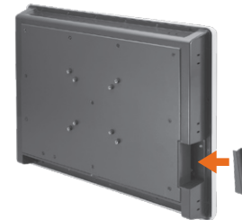
▲ CompactFlash™ slot with protective cover