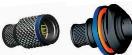
8BA1 In line receptacle 8BA7 Jam nut receptacle