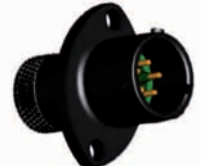
8LTA2 Oval flange receptacle