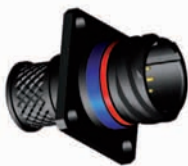
8DA0 Square flange receptacle