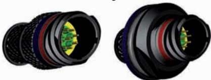
8DA1 In line receptacle 8DA7 Jam nut receptacle