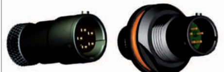
8LTA1 In line receptacle 8LTA7 Jam nut receptacle