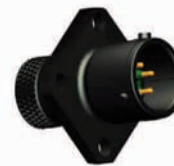
8LTA0 Square flange receptacle