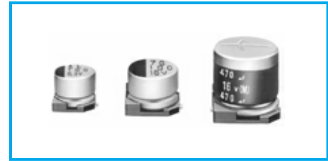
Marking color : Black print (except height : 10mm) White print on a brown sleeve (ø8x10L, ø10x10L)