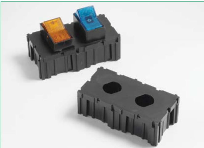
Dimensions in mm / Maße in mm