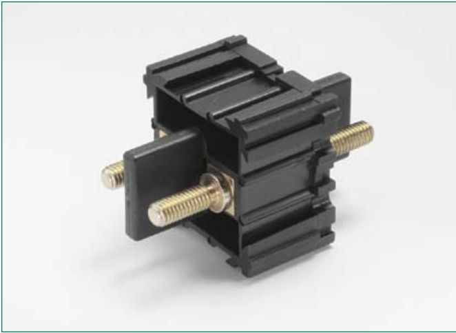
Dimensions in mm / Maße in mm