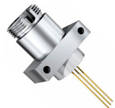
PD070-HL2-5xx FC Receptacle