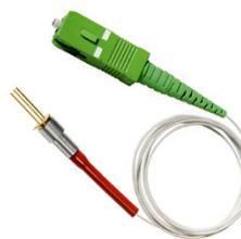
PD070-HL2-3xx SC/APC Pigtail