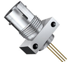
PD070-HL2-5xx ST Receptacle