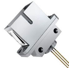
PD070-HL2-5xx SC Receptacle