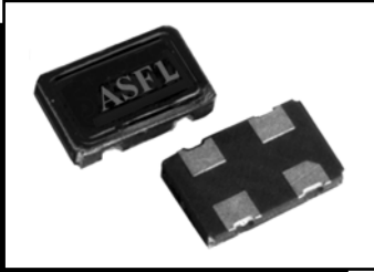
5.0 x 3.2 x 1.6 mm