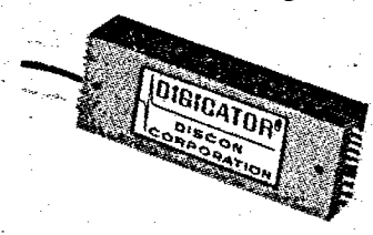
Chassis Mounted Integral Leads