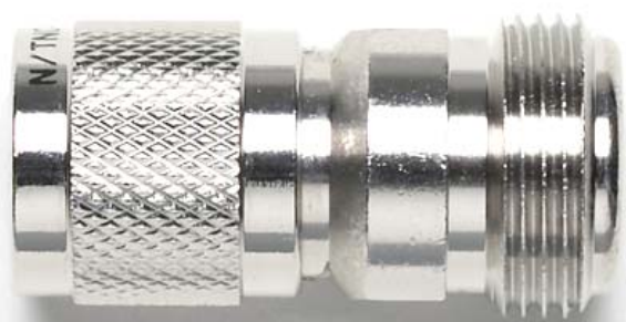
Model 73046 N Type Jack to TNC Plug Adapter