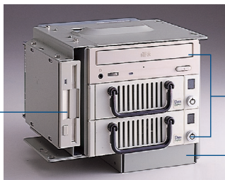
One 3.5" drive bay