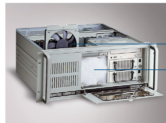
One 85-CFM hot-swap cooling fan