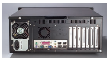
Rear view of ACP-4362MB