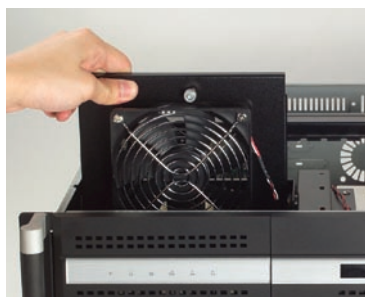
Easy-to-maintain system fan