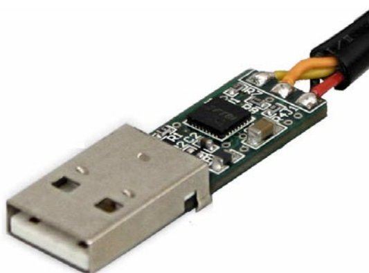
Figure 2 - Inside the USB 'A' connector on the TTL-232R.