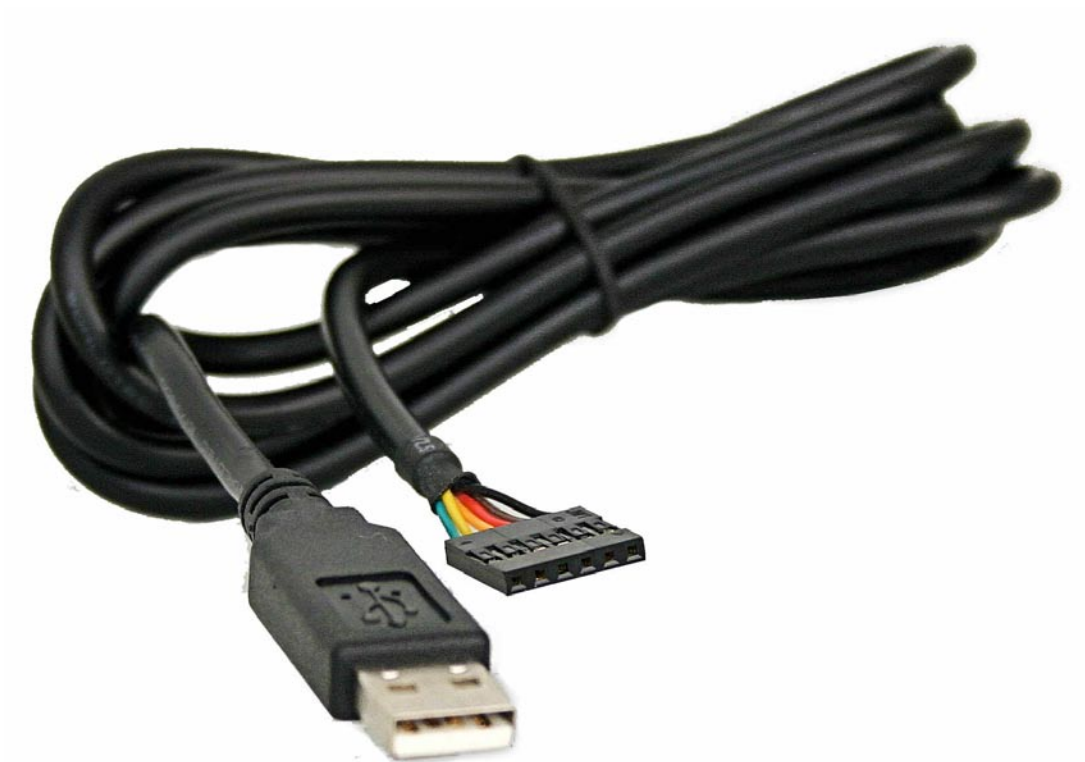
Figure 1 - The TTL-232R USB to TTL Serial Converter Cable.