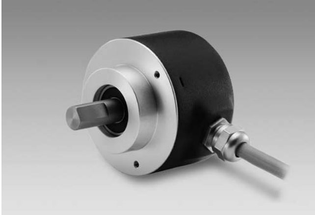
GPI0W with clamping flange