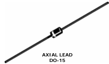
AXIAL LEAD DO-15