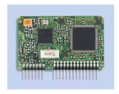
MT1503EDC DAB/DMB Tuner

The MT1503EDC is a high-end tuner module with integrated channel decoding and baseband processing capabilities for terrestrial digital audio broadcasting (DAB). It has been designed to meet the specific requirements of automotive applications.