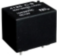
Dust Covered 26.8×21.5×22.3