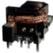
Open Type 24×19×20