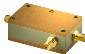
CASE STYLE: FM587 PRICE: $49.95 ea. QTY (1-9)