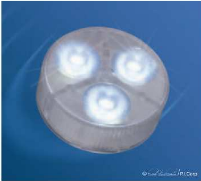
The new OSRAM SYLVANIA DRAGONpuck LED module for spotlighting applications.

With the addition of its new DRAGONpuck LED modules, OSRAM SYLVANIA is rapidly bridging the gap between the requirements of white light illumination and the capabilities of LED technology. These new modules offer bright and intense light for spotlighting applications such as landscape lighting, display shelves, under cabinet lighting, reading lights and other general illumination applications.