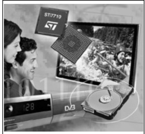
Figure 1. Package